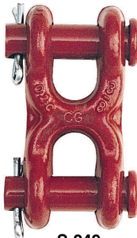
S-249 Twin Clevis Link

Not Suitable for use with Grade 80 or Grade 100 chain and chain slings used in overhead lifting.