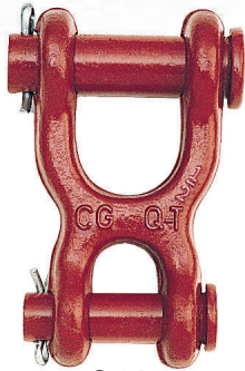
S-247 Double Clevis Link